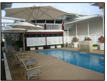
DAY 14: THU 08 AUG 2024