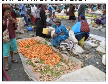
DAY 2: FRI 26 JULY 2024

Overnight Holiday Inn Express (or similar), Port Moresby includes breakfast