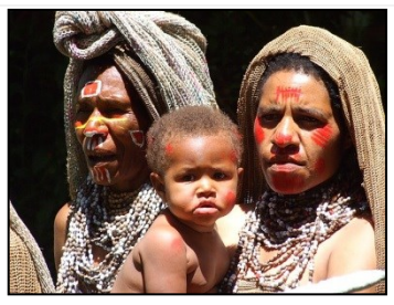
DAY 2: SAT 27 JULY 2024

Overnight Highlander Hotel, Mt Hagen includes breakfast