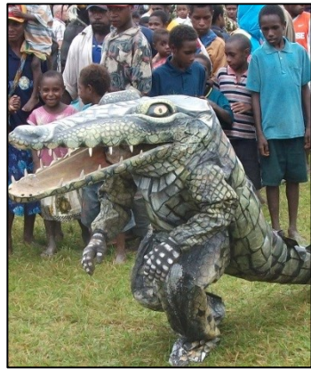
DAY 11: MON 05 AUG 2024

Overnight Avatip village guest house, Middle Sepik (includes all meals)